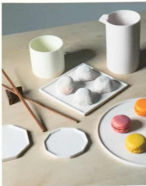
Nathalie Wood 'Detsu'